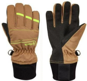
Brella Flexi Beige